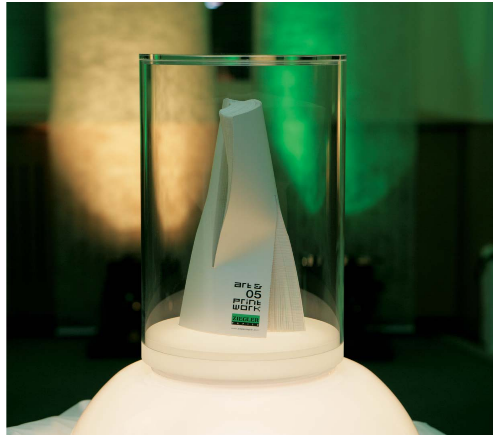
Award "Ziegler's best art & print work 05"

From 25.1. to 29.1.2006 the entire paper sector will be gathering in Frankfurt am Main. Over 2200 exhibitors from more than 60 countries will be presenting new products and trends for the coming season. We will be there at an inviting joint-stand to present our four product lines – Corporate Design, Natural Design, CAD/Office, Specialties – and to demonstrate their benefits and potential applications. We look forward to your visit. Please use the card opposite to order you admission ticket today and be inspired by our top-quality products.