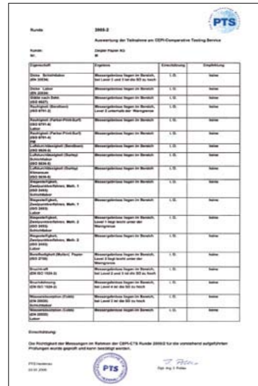
PTS evaluation 2005-2

* CEPI: Confederation of European Paper Industries