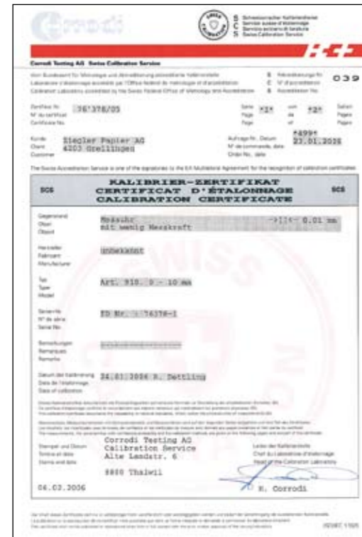
Calibration certificate from Corrodi Testing AG

We have service and maintenance agreements with all the suppliers of the equipment we use (Datacolor, Methrom, Mettler-Toledo, Frank GmbH, Lorentzen & Wettre, etc.). These prescribe the scope, nature and frequency of inspections. The results are documented in test logs, certificates, calibration records, etc.